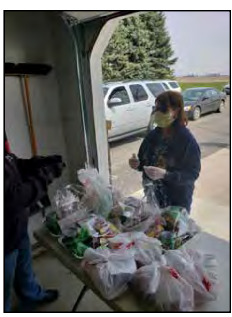
up her packages to deliver.