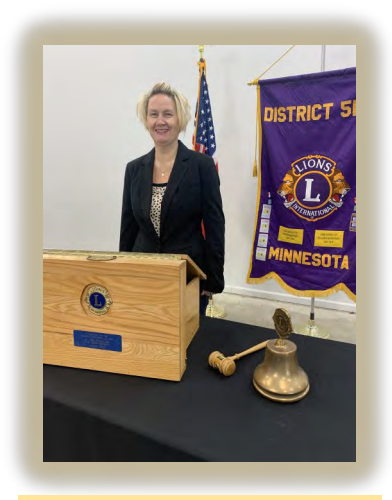
2nd Vice District Governor Elect