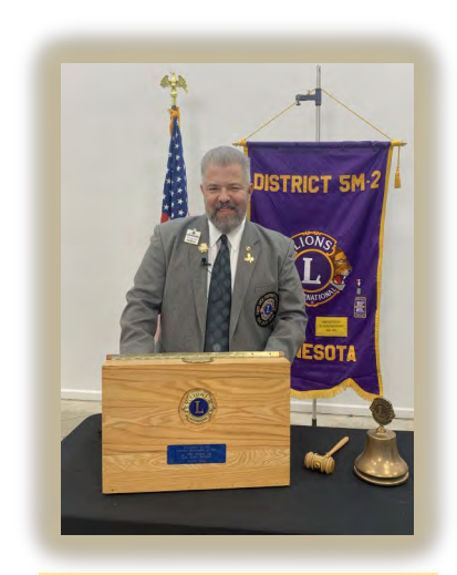
District Governor Elect